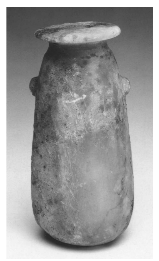
Fig. 9. An Alabaster Container Found from the Sarcophagus of Susa (Harper et al. 1992: 252, No. 180).

found, which bears the name of Ardashir the Achaemenid (Schmitt, 2001). Until now, not much is known about the Achaemenid burials in modern-day Iran, and our knowledge is limited to stone cemeteries of Pasargadae, Bozpar, and stone tombs of Persepolis and the Rustam Pattern. Some tombs were also recovered from Tang-e Bolaghi, Talesh, Roudbar, and the Sang Shir Cemetery of Hamedan.