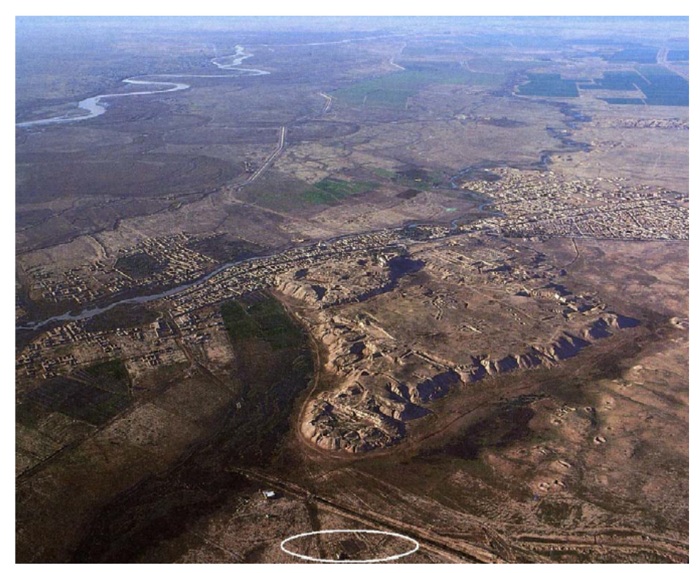
Fig. 1. Aerial Photo of the Susa and Location of the Sarcophagi of Hossein-Abad. Photo By George Grester (Thanks to Shahram Zare).

In the aforementioned region, a borehole of 5×10m was excavated leading to the discovery of a sarcophagus. The borehole's layers were almost intermingled, which yielded both plain and glazed earthenware of the Islamic and historical eras. Even at the depth of 220cm of the