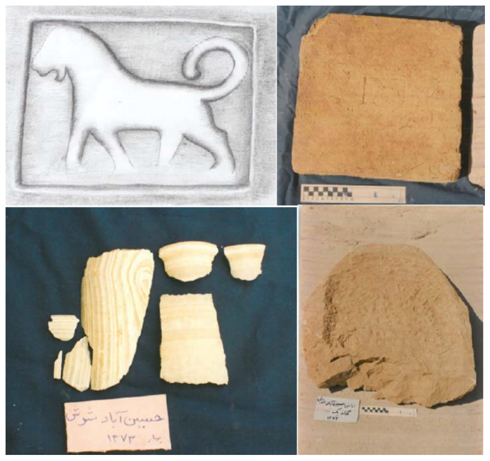
Fig 5. Findings Around the Sarcophagus 1, The Stone Lid of The Sarcophagi, Bricks with the Image of a Lion, and Pieces of an Alabaster Container.

the sarcophagus was no more than 38cm. The thickness at the bottom was measured between 26 and 28cm, while the wall was 10cm thick.