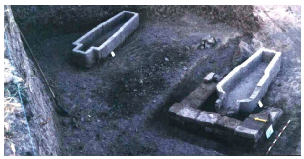
Fig. 4. Excavated Area and Sarcophagi, Right: Sarcophagus 1, Left: Sarcophagus 2.

they are highly fragile and vulnerable. If it is assumed that Shushtar or Dezful gravel stones were used to make Susa sarcophagi, the stones should have been carried there for construction.