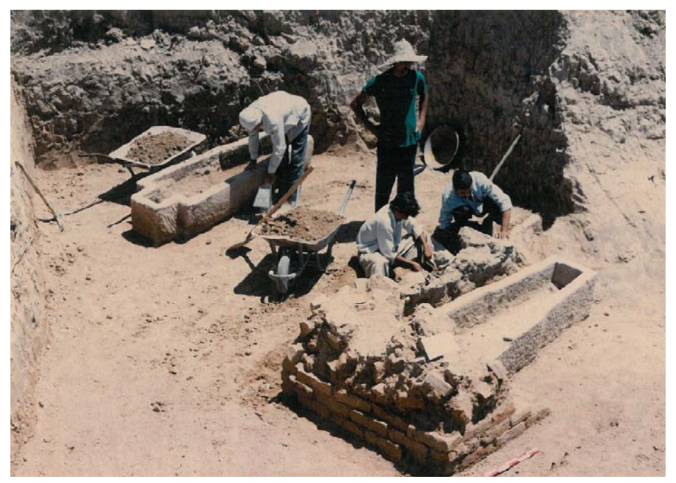
Fig. 3. Excavated Area and Sarcophagi, Right: Sarcophagus 1, Left: Sarcophagus 2.