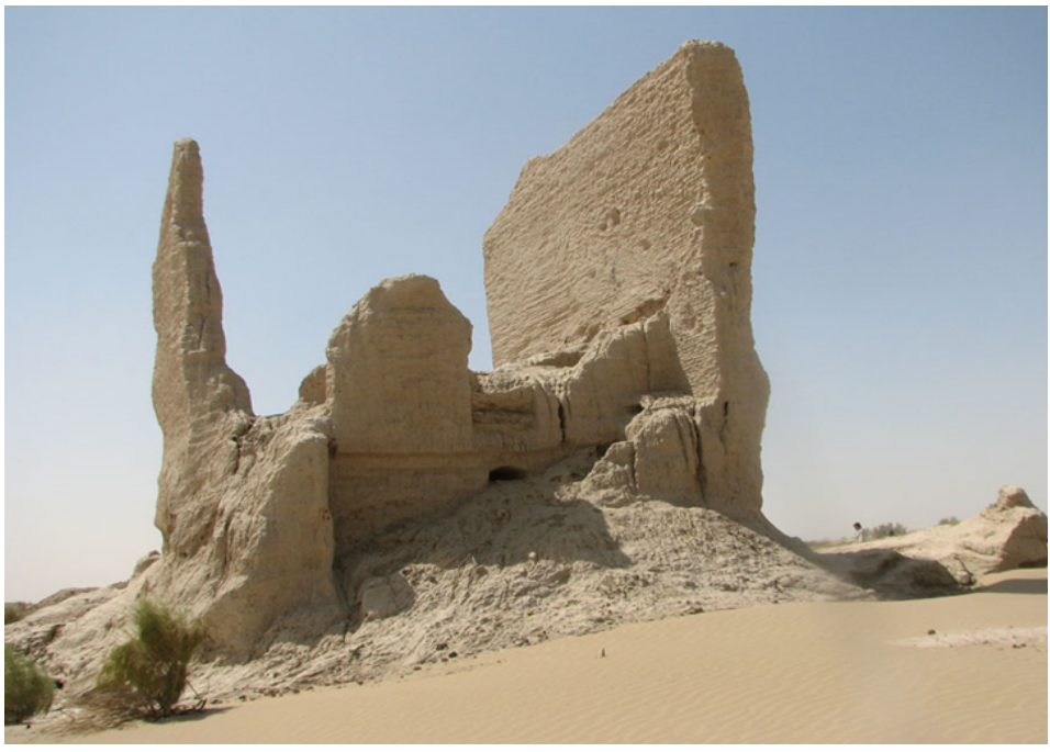
Fig. 4. The Ruins of a Windmill. Old Zahedan

race. Vegetation can be observed in various forms across fields, forests, and deserts. Typically, desert vegetation consists of scattered bushes devoid of plants. In these plant-free areas, furrows gradually form in alignment with the wind's direction, resulting in prominent ridges where bushes and vegetation are located. Flood currents also contribute to this phenomenon. The Hirmand River exhibits four well-known terraces, with many ancient sites in Sistan, including the burnt city found located on the Ramrud Terrace (Mousavi Haji, 2012: 58-59).