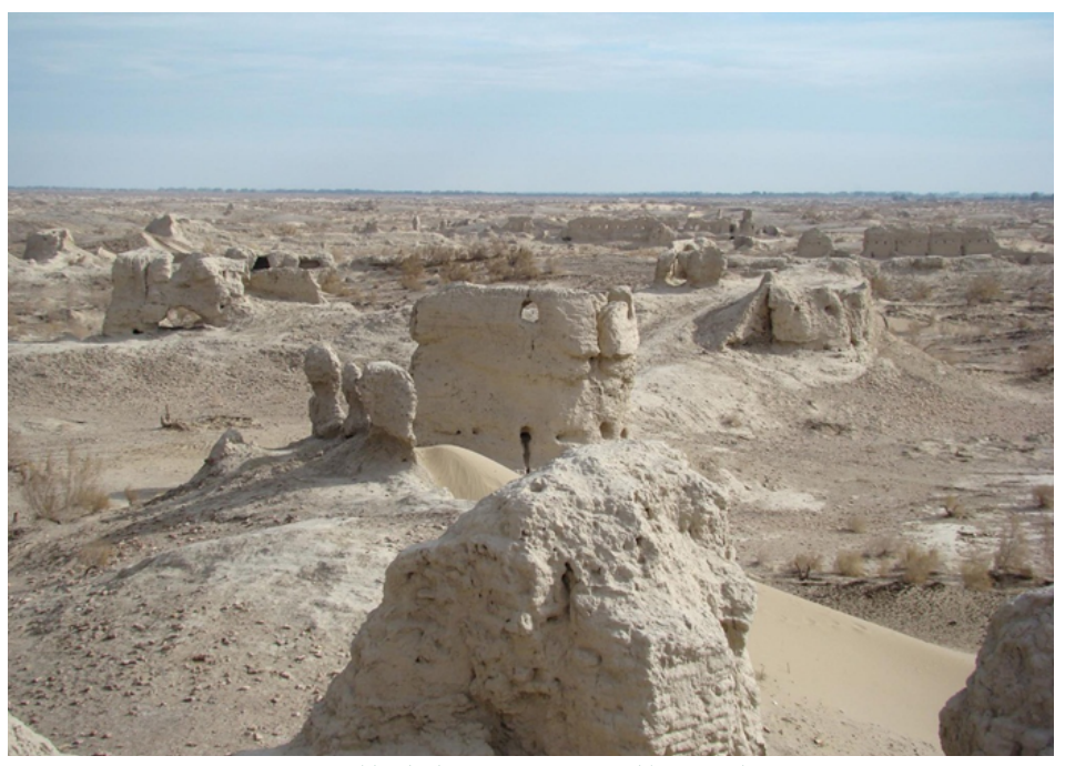
Fig 2. Old Zahedan. A City Destroyed by Tamerlane

moving bowl, where the limited water fills one-half of it and empties from the other part with each movement. The Hirmand River, situated within this vast bowl, experiences constant displacement, causing the streams and even Hāmūn Lake to shift back and forth. Consequently, with the movement of the Hirmand River causes cities and residential centers to relocate and shift their positions.