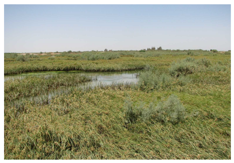
Fig. 1. Water and Vegetation Cover in Hirmand District

doned and the residents were forced to migrate to other regions within Iran. The principal cause behind this cycle of alternating development and devastation in Sistan was the complete dependence on the Hirmand River, coupled with the absence of springs, aqueducts, water wells, and sufficient rainfall in the region.