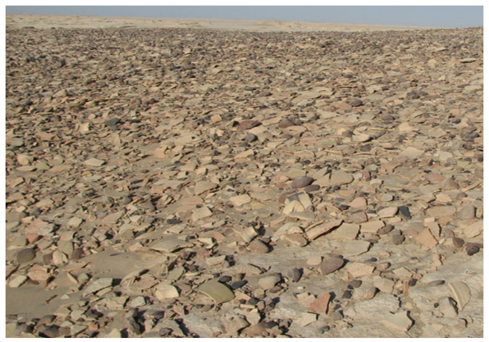
Fig. 3. The Surface of Many Ancient Sites in Sistan is Covered with Cultural Materials. Tasuki Area

ter, the living conditions are tolerable. However, when the lake dries up, the area transforms into a desert, making life challenging.