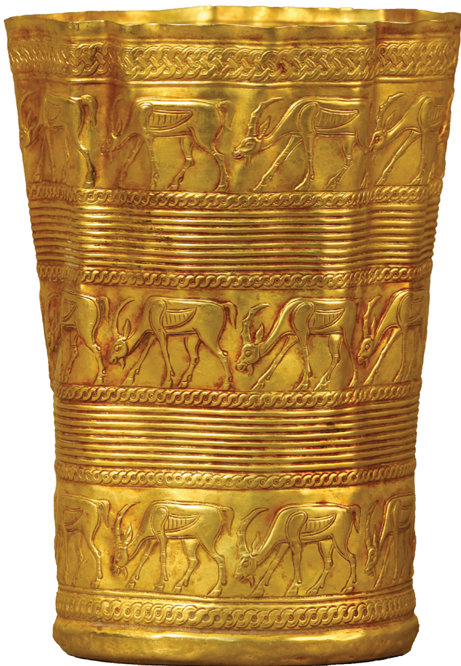
Fig. 1. A Golden Bowl (Mostazafan Foundation's Cultural Institution of Museum)