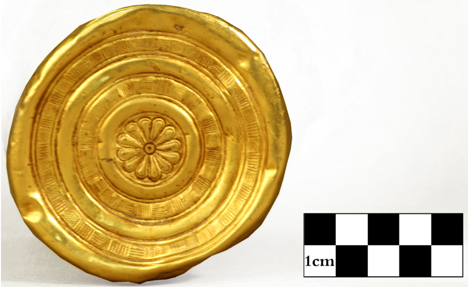
Fig. 2. The Bottom of Golden Bowl (Mostazafan Foundation's Cultural Institution of Museum)

gaze suggest that they are engaged in grazing and searching for grass or plants.